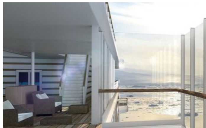
A balcony onboard the Hanseatic Inspiration

There are three dining choices; the main open seating restaurant, a speciality restaurant offering Japanese and Peruvian dishes and an indoor/outdoor bistro. A new Hanseatic Inspiration brochure detailing twenty two 2019/2020 expedition itineraries has just been published and is available at your travel agent.