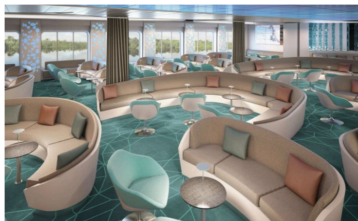
The atrium onboard the Hanseatic Inspiration