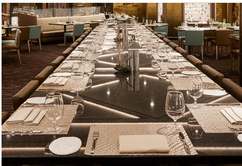
The Indochine restaurant for Asian culinart culture.

For wine appreciation, there will be private tours to vineyards and wineries, with tastings and special focus on the finest varietals and vintages, travelling on Silver Spirit and Silver Whisper. More at www.silversea.com/wine-voyages.html